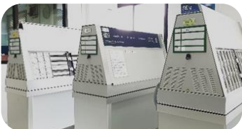
QUV Weathering Tester