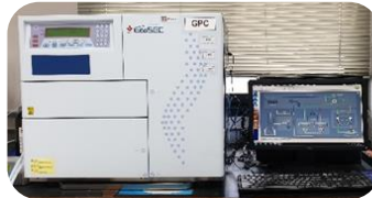
Gel Permeation Chromatography (GPC)