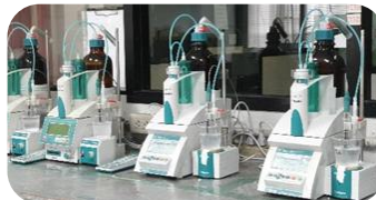
Automatic Potentiometric titration